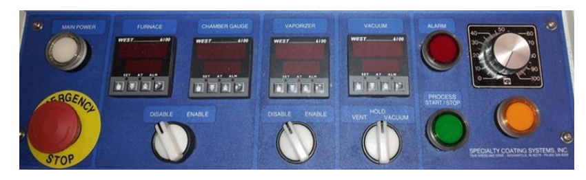
Figure 3 System front panel and sample chamber