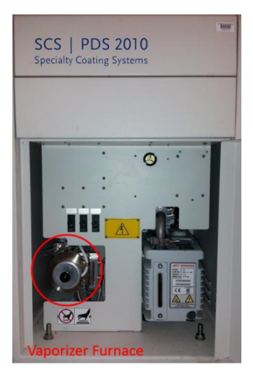
Figure 4 Vaporizer location for loading monomer