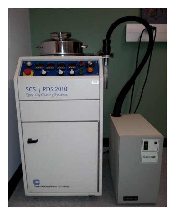
Figure 1 PDS 2010 System